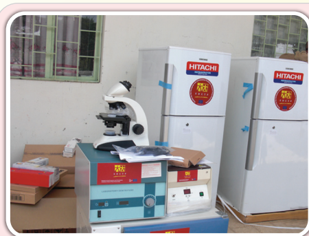
Laboratory Equipment purchased for Ethiopia by EDCTP in EACCR 1

Completed assessment surveys for 17 regional sister sites Completed infrastructural upgrades in over 20 prioritized clinical trial sites to improve research capacity Implemented upgrades of health, training, ICT, data and office facilities at 17 sister sites; the 4 coordinating centers and selected leading sites in Sudan & Ethiopia.