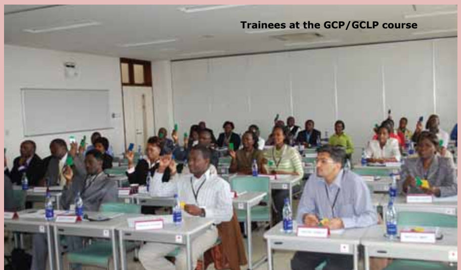
Trainees at the GCP/GCLP course

With financial support from EDCTP, KEMRI and PPB are currently developing a national registry for clinical trials in order to effectively regulate approval and monitoring of all clinical trials taking place in the Kenya. The registry is to be based at the Pharmacy and Poisons Board. A trial version of the registry has been developed. This project will be completed in December 2011 with a sustainability strategy in place to carry on these activities in the future.