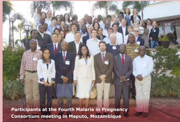
Participants at the Fourth Malaria in Pregnancy Consortium meeting in Maputo, Mozambique

See also: www.mip-consortium.org and www.manhica.org