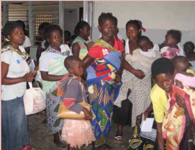
Mothers enrolling their children in EDCTP funded clinical trial at Ndirande Health Centre.

Research management at CoM is centralised and coordinated by a Research Support Centre. This set up clearly contributes to the success observed here and is a model to be emulated by other African institutions. The excellent collaboration and sharing of resources among researchers has minimised redundancy and enhanced utilisation of capacity developed.