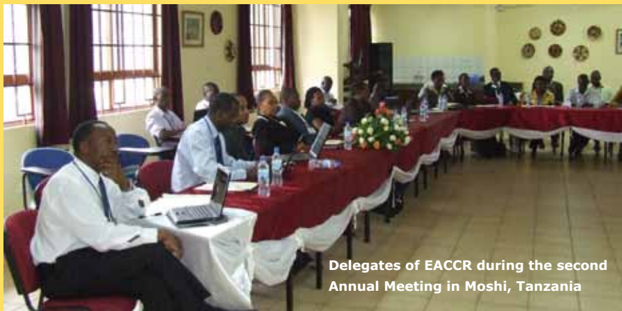
Delegates of EACCR during the second Annual Meeting in Moshi, Tanzania

The East African Consortium for Clinical Research (EACCR) convened its second Annual Meeting at the Kilimanjaro Christian Medical Centre (KCMC) in Moshi, Tanzania on 18 and 19 April 2011. The meeting was attended by 87 regional participants, including 2 EDCTP-funded Senior Fellows, some Masters degree fellows at KCMC and other participants from Ethiopia, Kenya, Uganda, Sudan and other institutions in Tanzania.